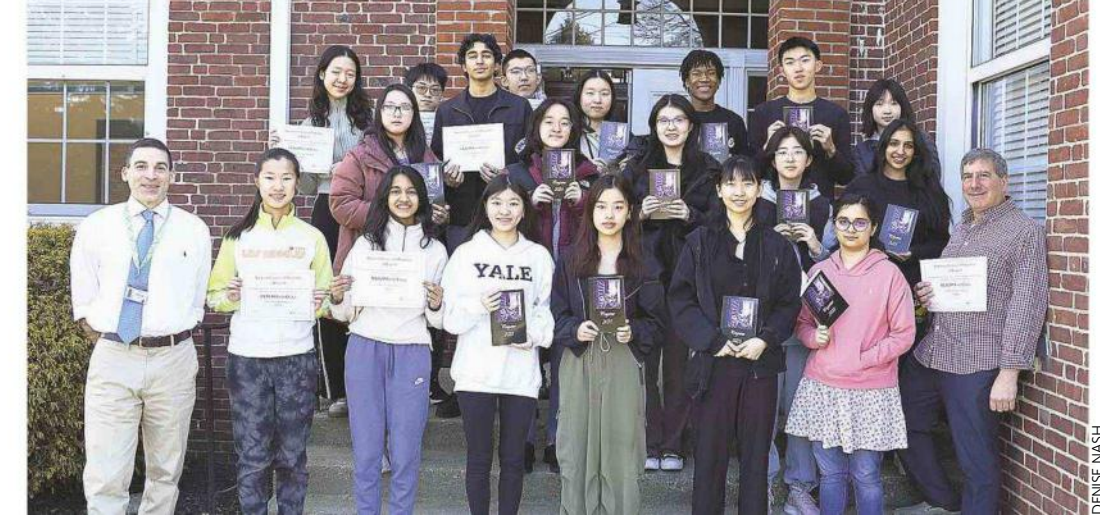
Jericho High's Pegasus was among the Long Island student magazines to win the National Council of Teachers of English's REALM (Recognizing Excellence in Art and Literary Magazines) contest.

Long Island high schools with winning magazines in the